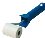
ROLLER page 393