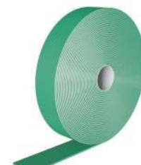
NAIL PLASTER page 134