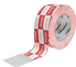
SPEEDY BAND page 76