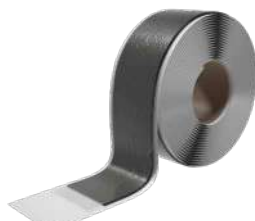
BLACK BAND page 144